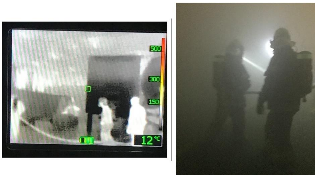
Figure 4.2: View during an onboard fire drill using (a) a thermal image camera and (b) regular field of view

Through the field work conducted in WP1 of the ELBAS project, several different onboard fire drills were observed. The drills included Emergency Mustering of crew dressed in SCBA firefighters’ outfits, which was carried out as per the ship’s Emergency Muster List, with a fire scenario of a simulated EV fire on a vehicle deck. The fire drill included the use of a smoke machine to provide the effect of impaired visibility and the seat of the simulated fires were inside of a luggage wagon. In both cases, firefighting teams in full bunker gear entered the vehicle deck to actively fight the simulated fire with charged fire hoses and other equipment. In addition, where practicable reduced lighting and obstacles were used, to simulate realistic conditions during an actual fire (see Figure 4.2.)