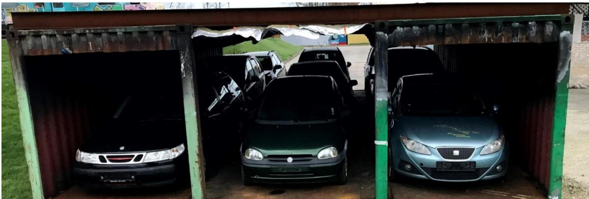
Figure 4.5: Specialized Test and Training Set-up simulating a Vehicle Deck

To better address these obstacles, experiments were conducted through the ELBAS Project to simulate a realistic fire scenario aboard a fully loaded vehicle deck. The experimental set-up, shown in Figure 4.5, consisted of nine cars (8 conventional cars surrounding a single electric vehicle) placed within a structure built from ISO 40 ft shipping containers to simulate a vehicle deck. This type of fire testing, detailed in section [31] (WP3: Live Fire Testing), helped to test the applicability of various firefighting tools. Such an experience is not practicable to conduct during the onboard Fire Drills, nor is part of the mandatory STCW shipboard fire training.