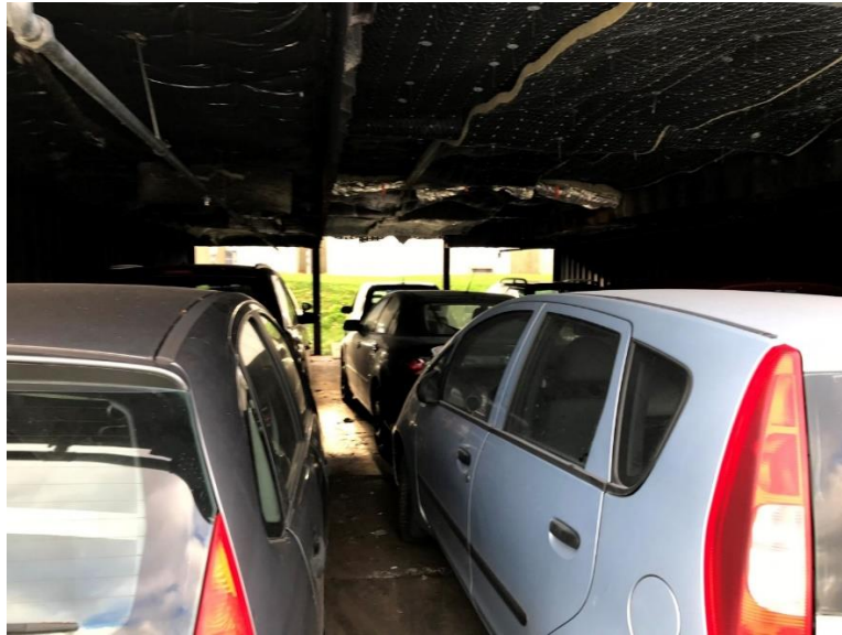
Figure 4.6: Inside the Specialized Test and Training Set-up Simulating a Vehicle Deck

The main structure of the vehicle deck set-up consisted of combining two standard 40-ft ISO shipping containers, connected with steel plating with stowed vehicles inside, see Figure 4.6 and Figure 4.7.