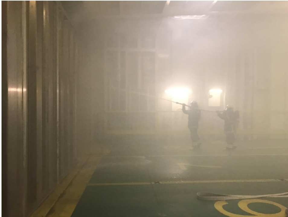
Figure 4.10: Onboard Fire drill with use of a smoke machine and charged hose lines

By engaging with local shore-side emergency services, challenges can be identified and addressed, and contingency plans developed to be best prepared for an EV or other fire incident onboard. It would be advisable to invite for knowledge sharing and a preparedness exercise with emergency managers, to help increase awareness of specific shipboard installations, available firefighting equipment and SMS procedures in use onboard. The advantages of involving the local shore-side emergency services in the planning of shipboard emergency response procedures helps ensure the best congruencies when dealing with an EV fire situation, which potentially may develop into a larger incident requiring assistance from shore.