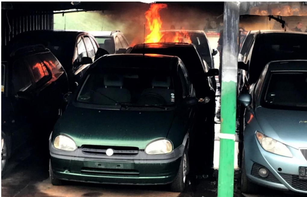
Figure 4.7: Initial Vehicle Fire in the Specialized Test and Training Set-up