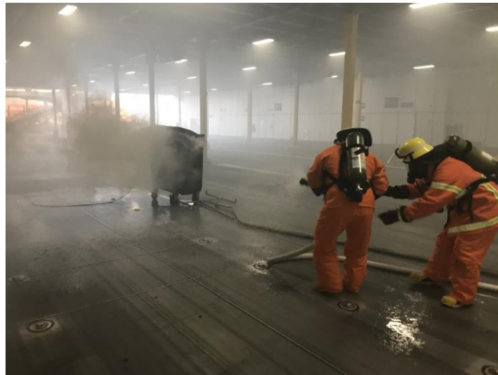
Figure 4.3: Fire drill onboard ship, with the use of smoke machines and charged fire hose lines

Shipboard fire drills are generally conducted on an empty deck, without vehicles, due to operational costs and constraints. These training simulations, as seen in Figure 4.3, provide vital response criteria such as firefighter response times, firefighter equipment readiness, fire protection system functionality, detection network responsiveness, and smoke/obscuration conditions during a fire event.