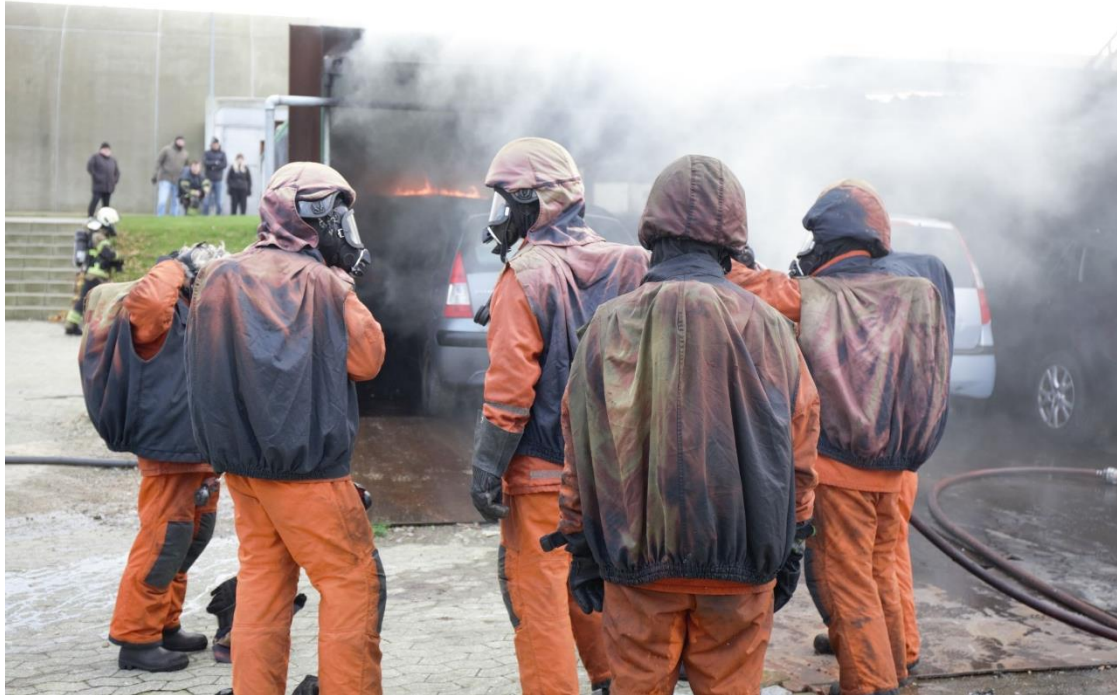
Figure 4.8: Realistic Live Fire Training of a Vehicle Deck Fire

Based on the experience gained in the ELBAS project a new training course, with focus on crew training of how to extinguish a fire in a modern vehicle on board a ship, has been developed, see Figure 4.8.