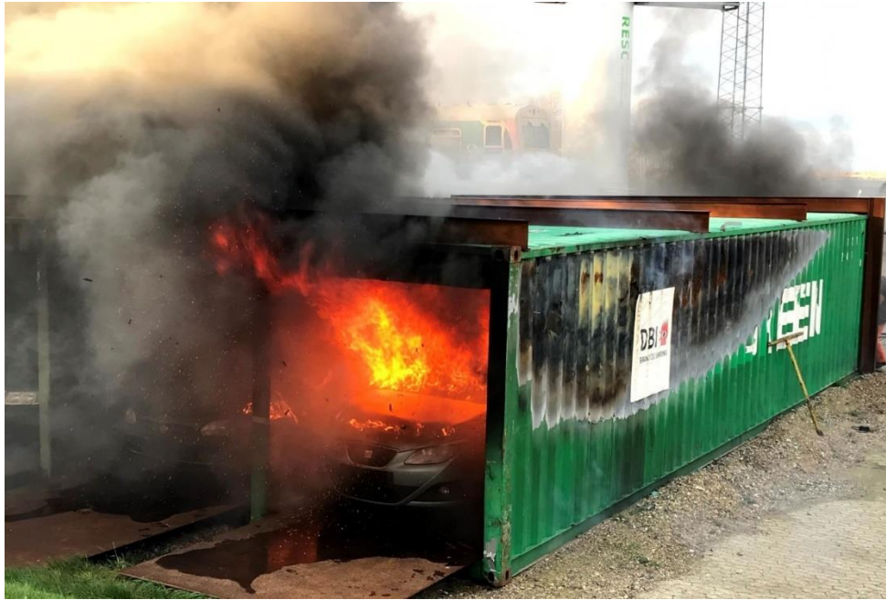
Figure 4.9: Fully developed vehicle fire(s) in the specialized test and training set-up

Feedback received from the ship-based participants of the pilot course held during the ELBAS project, was very positive. The experience gained from training on real burning vehicles in a set-up, which resembles a vehicle deck, was unique and realistic of what might be encountered in a real situation onboard.